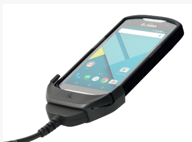
Rugged USB/Charge cable (CBL-TC51-USB1-01)