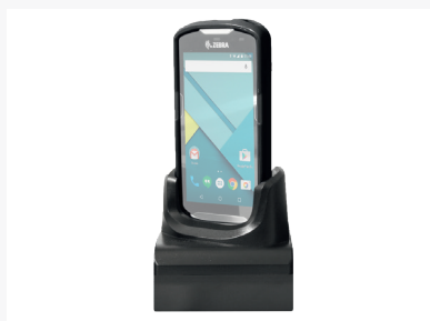
Slot share cradle (CRD-TC51-1SCU-01 + CRD-TC51-5SCHG-01)