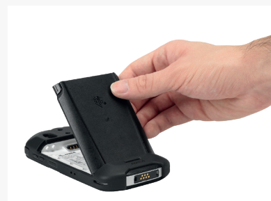
Spare battery changing without removing the case (battery swap)